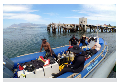
A survey of the Robben Island jetty with Table Mountain, Cape Town in the background.

theory and practical training in using a magnetometer to search for MUCH sites and the integration of the data with the Site Recorder program.