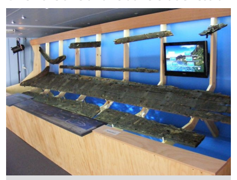
Darlington boat timbers display at Triabunna.

In December 2009, severe flooding at the Darlington convict site on Maria Island revealed a previously buried section of boat timbers, measuring some 5 m in length, near the outlet of a creek. The timbers were retrieved for conservation and analysis. The section appears to be from the side of a small clinker-built vessel fastened with treenails and caulked with pitch or tar. Given the size and relative crudeness of