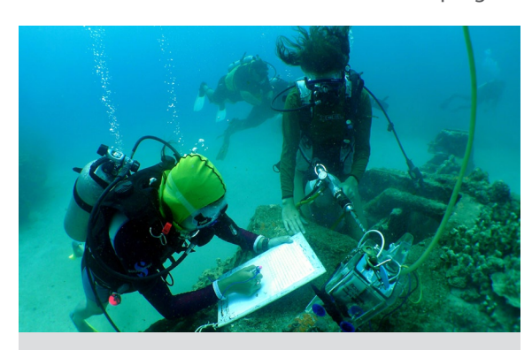
Corrosion measurements being taken of the USA World War II Amtrac (Amphibious tractor) by NAS students.

The aims of this project were to provide training in maritime archaeology field techniques to a number of students/participants in Guam. The Guam Preservation Trust (GPT) had identified maritime archaeology as an important topic in helping to reveal aspects of Guam's maritime and underwater cultural heritage and it was keen to introduce students to this topic who could use the knowledge and techniques in their future employment or further studies in Guam.