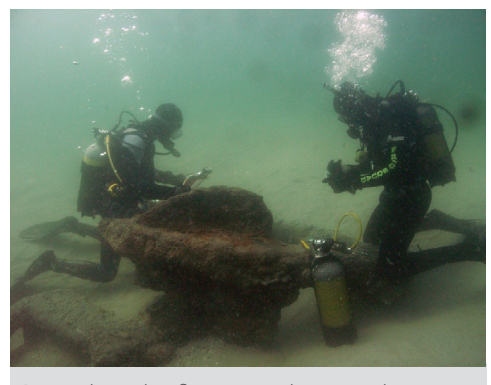
Recording the five metre long anchor on the barrel wreck.