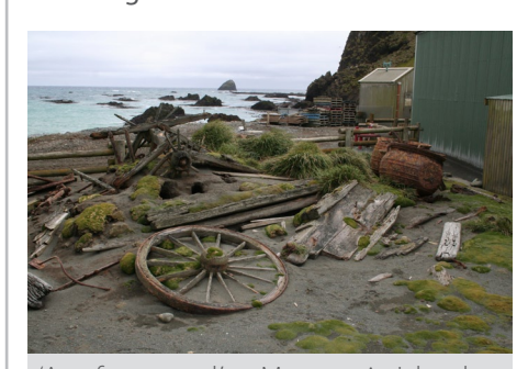
'Artefact corral' at Macquarie Island, before the recent work.

Sub-antarctic Macquarie Island has a history of sealing enterprise from 1810 onwards, and early Antarctic exploration from 1911. There are a range of heritage sites on the island, including a collection of artefacts that