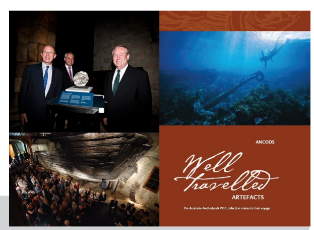
SIDEBAR Download the information book-let of the "Well-Travelled Artefacts" exhibition from: https://files.me.com/wvd1/vq2738