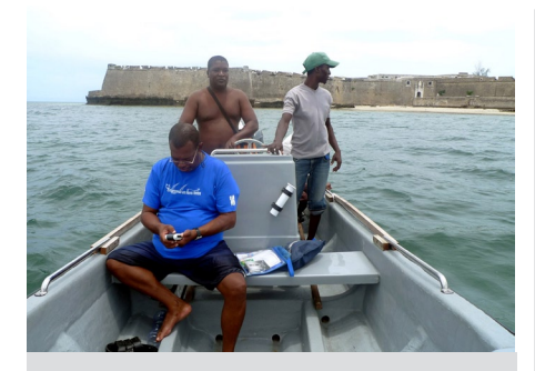
Members of the Working Group established on Ilha de Mozambique familiarising themselves with the use of a GPS.

histories, magnetometer survey, site investigations, investigation of logistics for the larger project, and consideration of requirements under the the UNESCO Convention on the Protection of Underwater Cultural Heritage 2001. The project was funded by UNESCO Dar es Salaam and the Embassy of the Kingdom of the Netherlands in Dar es Salaam.