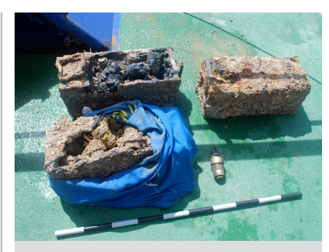
Unexploded ordnances discovered in May 2010.

The Heritage Branch is not directly involved in the mitigation of this issue. However, thanks to good working relationships, we are provided reports on what is discovered and its location, as well as the opportunity to witness recovery when possible. Since the team that remove the material include ordnance experts from Defence, we can be assured that the identification of types is accurate. As these discoveries continue we will be able to build up a list of finds and a map showing where deposits were located.