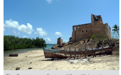
The Portuguese Fort on Kilwa Kisiwani, dating from the 17th century later used by the Omanis from Zanzibar during the 19th century.

It was considered the most effective first step in developing the comprehensive project would be to conduct some preliminary site investigations and training. This would involve a smaller team to visit Kilwa and to implement a number of activities. The following activities were carried out from 14-27 November 2010 and involved nine of the Tanzanian team and a representative of South Africa, Namibia, as well as CIE: community liaison and collection of oral