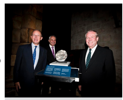
Netherlands Ambassador Mr Willem Andreae and WA Premier Colin Barnett at the official ANCODS hand-over.

A special temporary exhibition titled "Well-Travelled Artefacts", dedicated to the Netherlands ANCODS collection, can be seen until November 2011 in the Batavia Gallery of the Shipwrecks Gallery of the WA Museum, Fremantle.