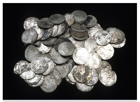
Silver coins from Zuiddorp