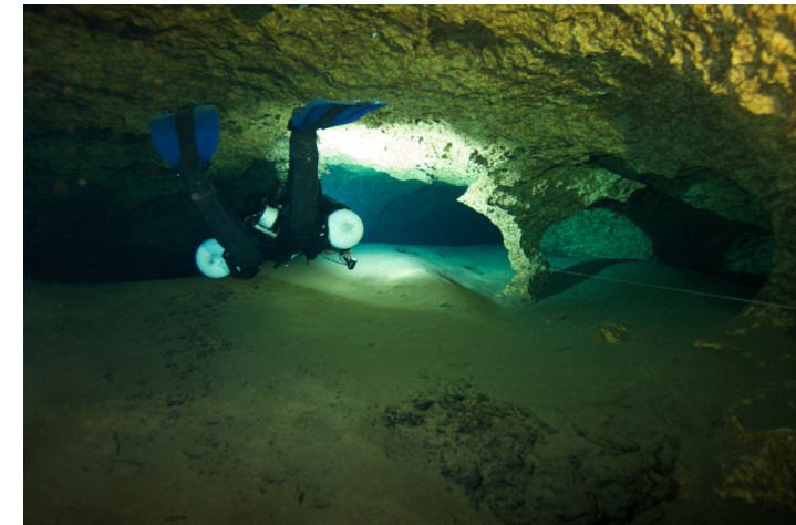
Ag swimming in the 'Big Tunnel' in upstream Mission.