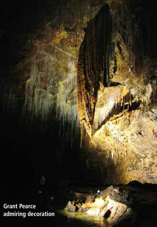
Grant Pearce admiring decoration

Compared to Tiger's Eye the vis at 6m was absolutely crackling... well, it was if you were the first one through.