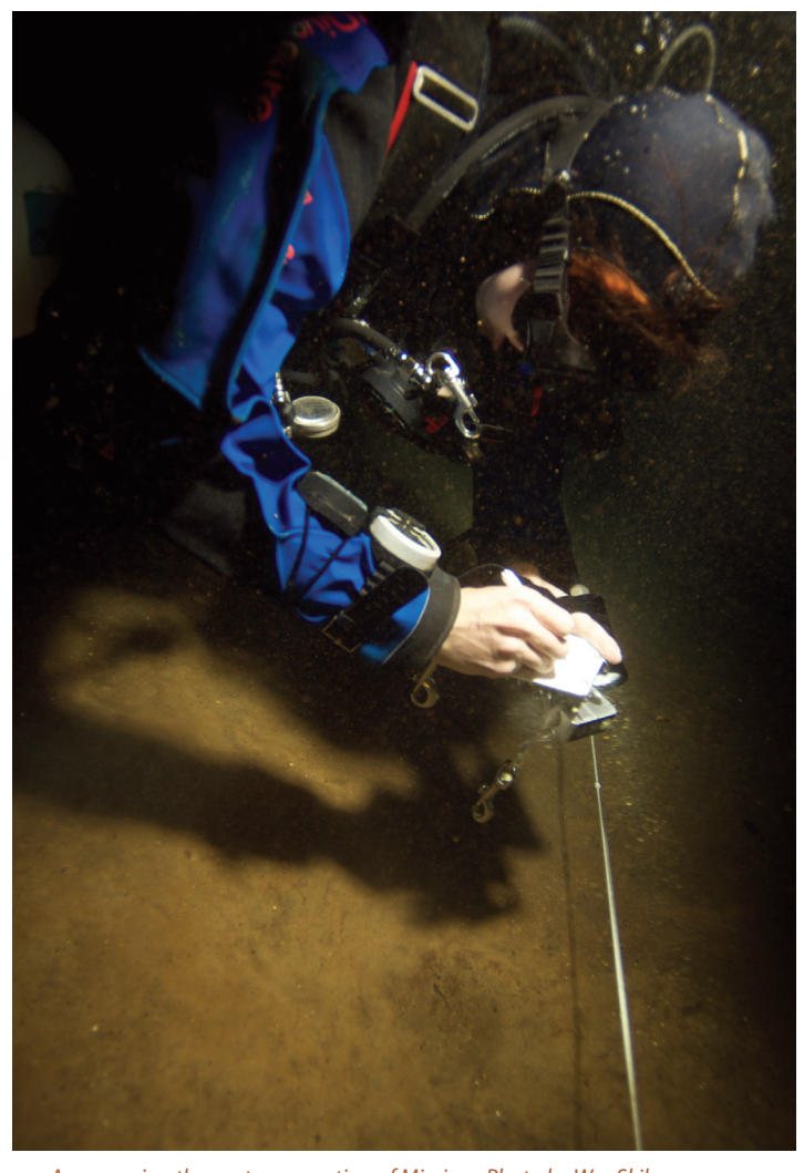
Ag surveying the upstream section of Mission.

The scraggly and perfect passages in the 'Delicate Tunne.I' (p 12 Cover Photo) One of the numerous clay banks in the 'Bonus Tunnel.' (p13 Top) The remains of a fallen animal. (p 13 Center)) Indian pottery shard. (P 13 Bottom)